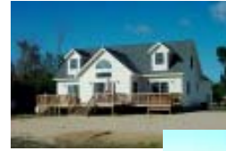
Great Building Sites